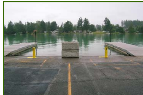
Boat launch controlled access