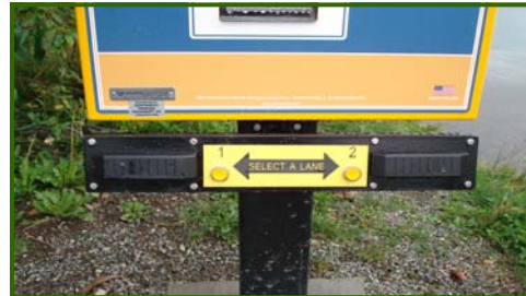
Pay station and lane selection for boat launch