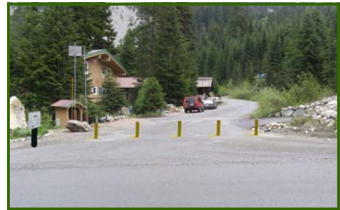
Snow country community access

DUAL BOLLARDS W/ INDEPENDENT OPERATION STAINLESS STEEL FABRICATION COLOR (Caution Yellow is standard) HEATERS FOR BOLLARD AND CONTROL CABINET BATTERY BACKUP 220VAC or 208VAC ACCESS CONTROL DEVICES