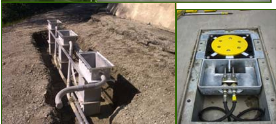
Fabrication and installation